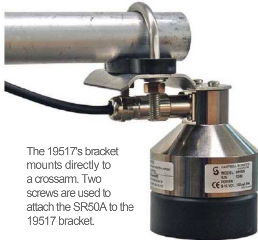
The 19517's bracket mounts directly to a crossarm. Two screws are used to attach the SR50A to the 19517 bracket.