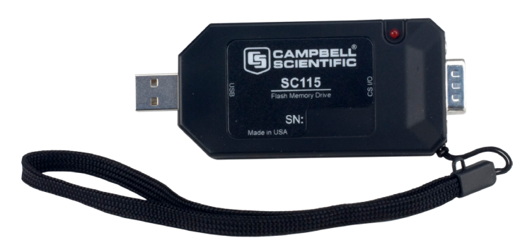
The SC115 is a light-weight, portable instrument that fits in a pocket allowing easy transport between the datalogger and PC.

The CR800 and CR850 can use the SC115 2 GB Flash Memory Drive to augment onsite data storage or to transport data between the datalogger and PC.