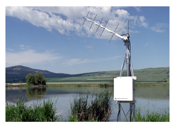
Our GOES transmitters are used for stream stage (shown), water quality, and rainfall applications.

Satellite transmitters offered by Campbell Scientific include a NESDIScertified GOES transmitter, an Argos transmitter, and an Iridium transmitter. Satellite telemetry offers an alternative for remote locations where phone lines or RF systems are impractical.